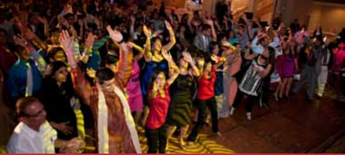
Bollywood Entertainment by RDB July 16th 2011 Meet & Greet by NIAC/NIAPPI