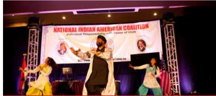
Bollywood Entertainment by Signature of Britain has Talent Fame July 16th 2011 Meet & Greet by NIAC/NIAPPI