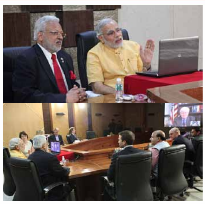
CM Modi in a historic video conference with Speaker Gingrich