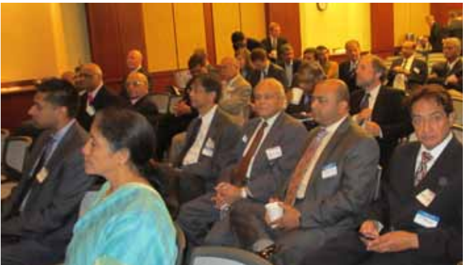
Community Leaders from all across USA at Coffee with Congress to Cut-off Foreign Aid to Pakistan