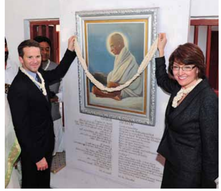
Congressman Schock and Chairwoman Rodgers in Ahmedabad, India